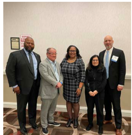
Members of the Center's ADR DE&I Initiative in New York