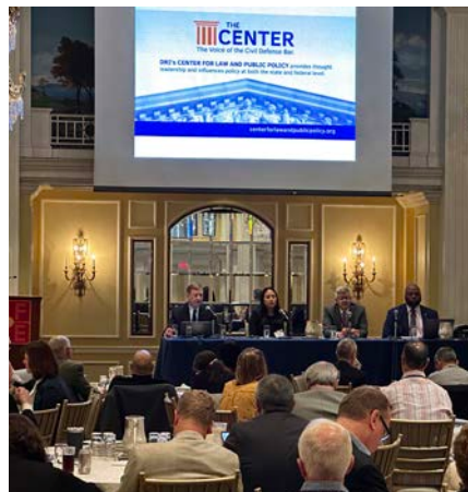
2023 NFJE Symposium Center Panel