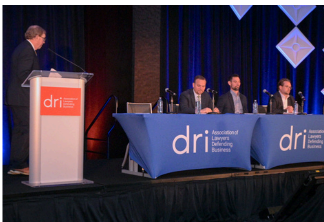
Advanced Insights & Strategies to Address Third-Party Litigation Funding Session at DRI’s 2025 Annual Meeting. Sponsored by and featuring speakers from the DRI Center for Law and Public Policy’s Third-Party Litigation Task Force.