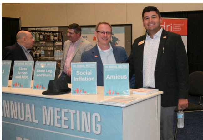
DRI Center for Law and Public Policy Reception at DRI’s 2025 Annual Meeting.