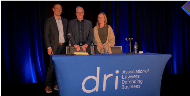
Speakers of DRI's 2025 Annual Meeting mainstage CLE session: "The State of the Administrative State After Loper Bright and How to Navigate It as a Practitioner."