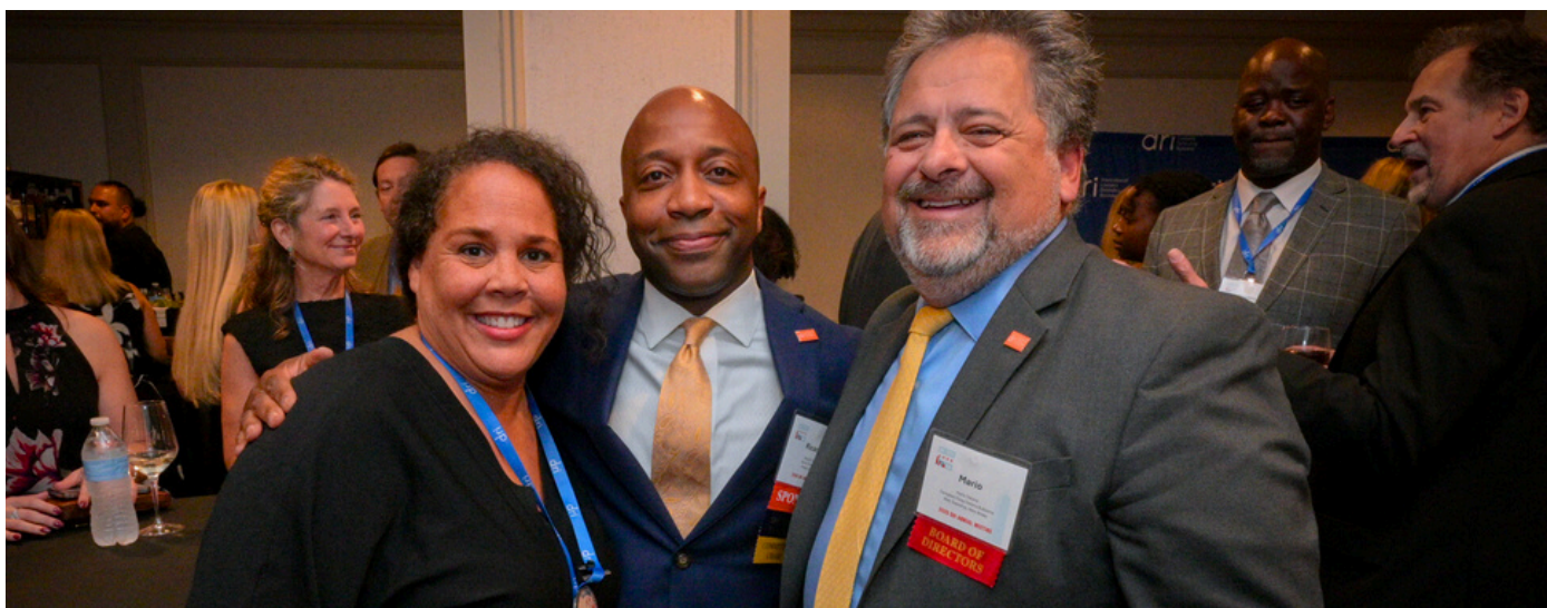
2025 Annual Meeting