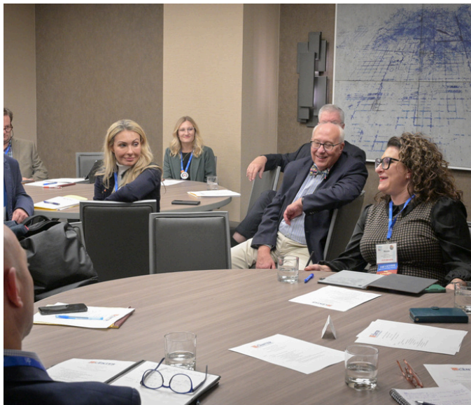
The DRI Center for Law and Public Policy members meet at DRI's 2025 Annual Meeting.

Stay up to date with the DRI Center for Law and Public Policy's projects and initiatives for the benefit of DRI members, their clients, the business community, consumers, and principles of judicial economy by reading the DRI Center for Law and Public Policy newsletter--created in 2023 and sent to all DRI members quarterly--and by following the DRI Center for Law and Public Policy on LinkedIn and X (Formerly Twitter) .