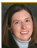
Laurie K. Miller Law Institute

PRESENTED BY DRI's Governmental Liability Committee