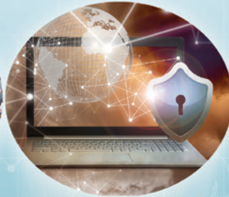
Cybersecurity and Data Breach