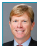
E. Todd Presnell Law Institute