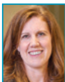
Mary Re Knack Law Institute

PRESENTED BY DRI's Intellectual Property Litigation Committee