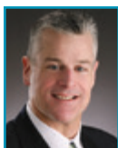
Christopher T. Sheean Law Institute

PRESENTED BY DRI's Trucking Law Committee